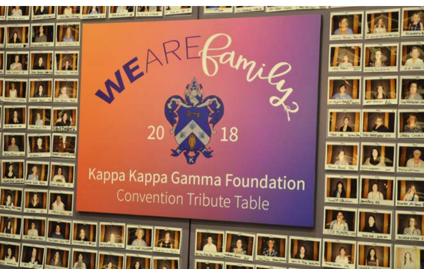
The Tribute Table in Denver raised over $114,000 in Foundation donations.