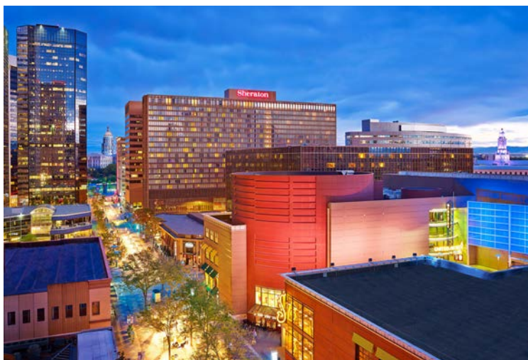
Downtown Denver was home base for Convention 2018 where attendees welcomed Kappa’s three newest chapters during the Parade of Flags.