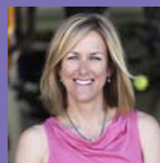
Kristin Armstrong Savola, Idaho